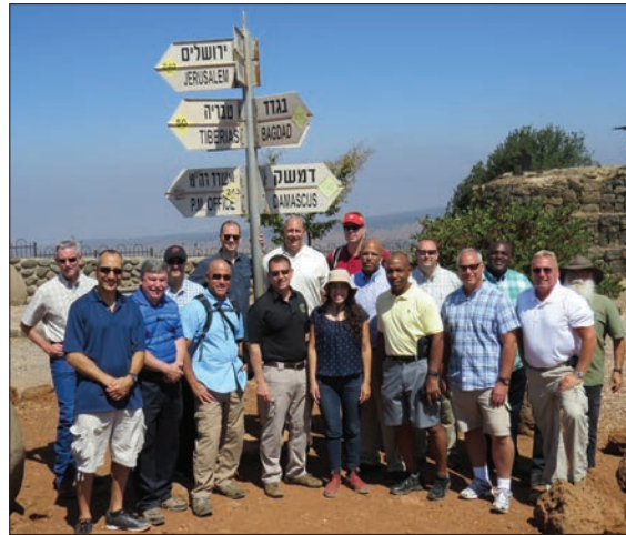
NCTS 2016 at Mount Bental, Golan Heights, Israel