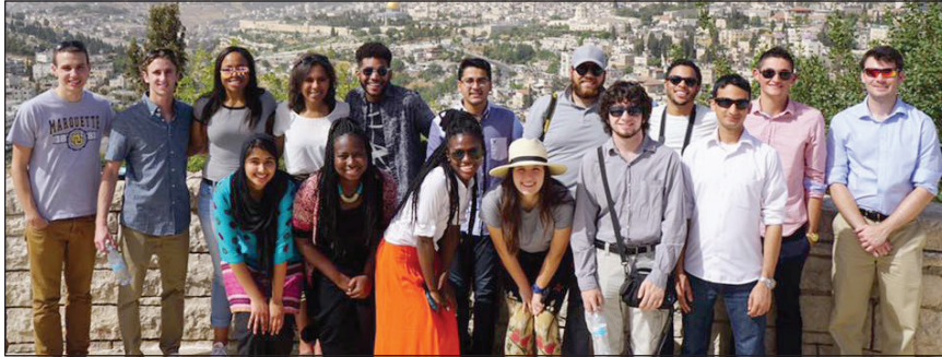
2016 Campus Leaders Mission in Israel

Our Campus Leaders Mission to Israel is a terrific opportunity for college students from all religions and backgrounds to experience Israel up close, in all its nuance and complexity. Qualified applicants must be college students who have not previously visited Israel and exemplify leadership on their college/university campus – such as political involvement, student activism, and publishing of campus newspapers. This year, ADL hosted students from schools across the country, including Loyola University Chicago, George Mason University, and Boston College.